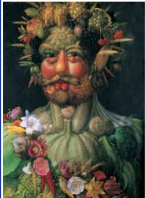
The Habsburg Emperor Rudolf II as Vertumnus, by Giuseppe Arcimboldo, 1591. Skokloster Castle, Sweden